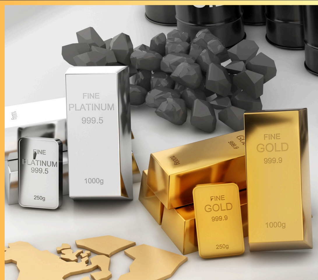
GOLD , SILVER, METAL