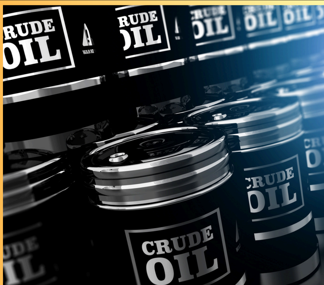
CRUDE OIL, NATURAL GAS